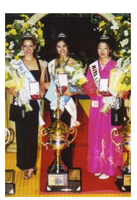
Miss Taekwondo Int'l