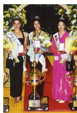
Miss Taekwondo Int'I